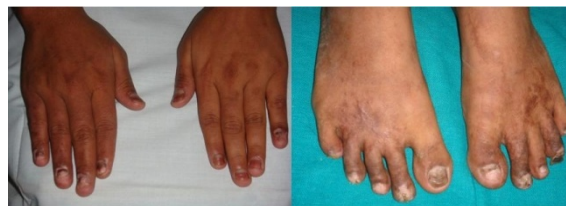
Figure 2. Shedding of hand and feet nails in 4 weeks