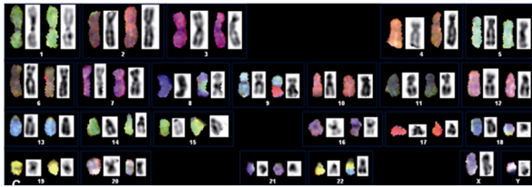
Figure 2. SKY on the lymphocyte metaphase showing the representative karyotypes illustrating the display colours on the left and the classification colours on the right. In the center, there are the DAPI band images